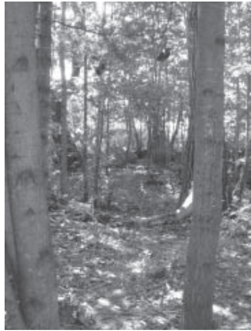
GPS Technology & an Old Map