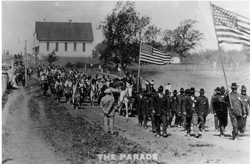
Photo: Early patriotic parade at Walker