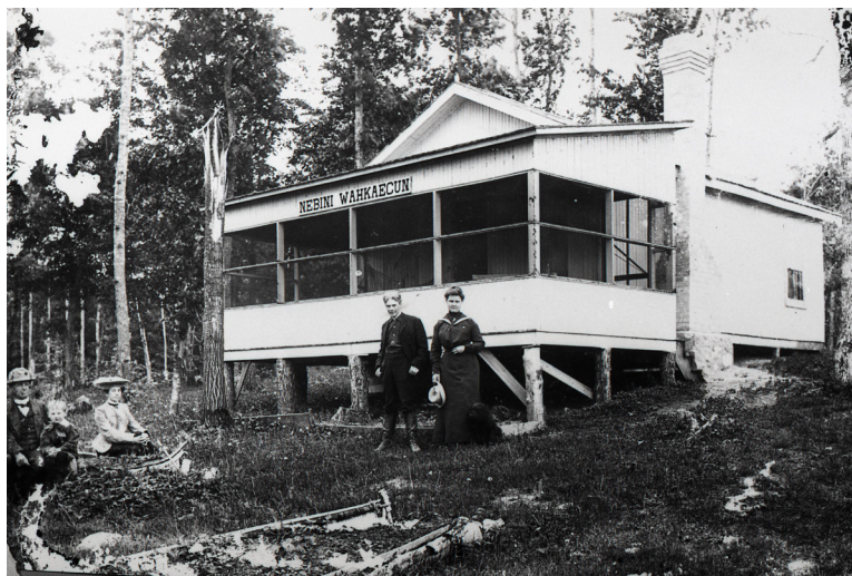
Photo: Postcard of one of our early resorts

The "late starters" had in mind long hours of dancing for the evening and early morning hours. The Norway Lake pavilion and the dance hall at Longville will draw the regular holiday quota.